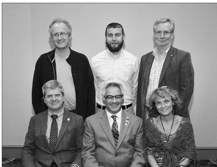
SEPM 2016 – 2017 Council

Managing Editor – PALAIOS Email: Palaios.editor@gmail.com