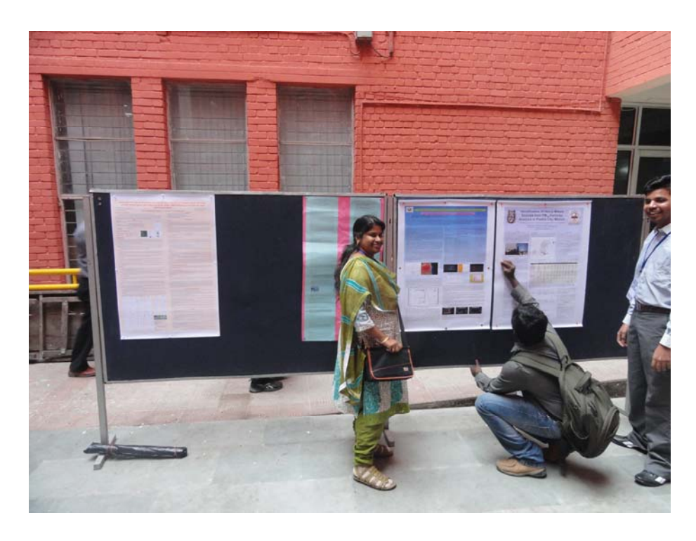
Posters session attended by the delegates