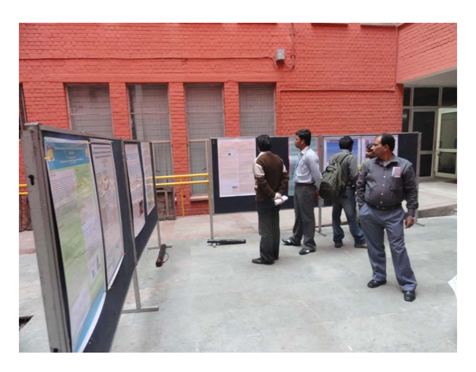
Delegates attending the poster session