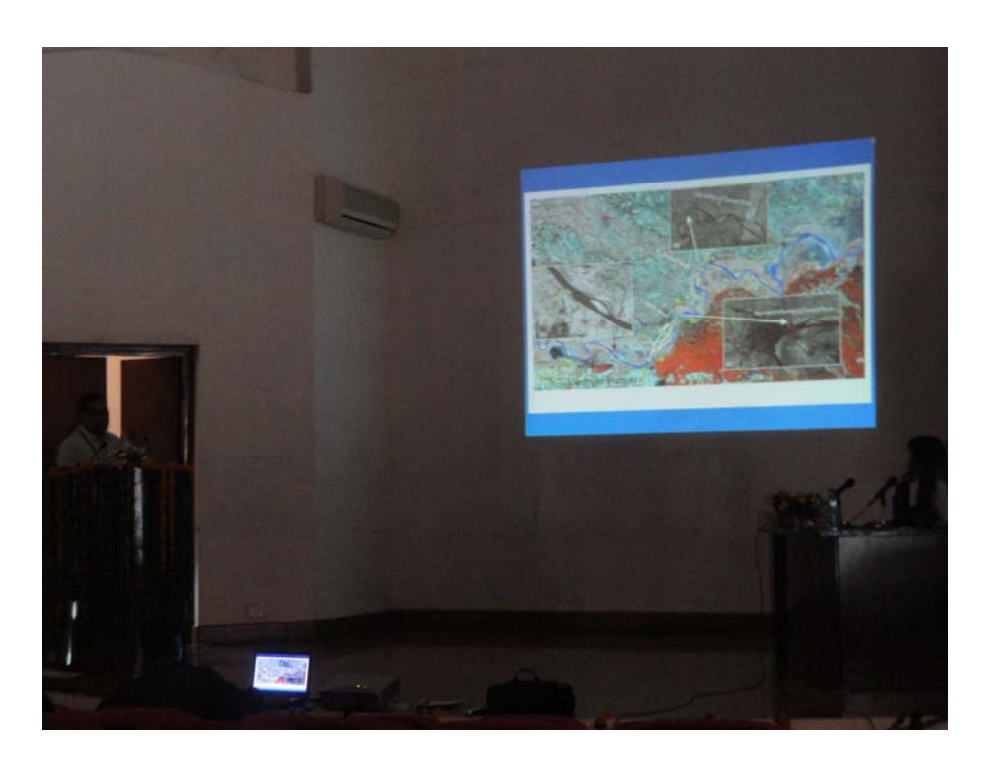
Oral presentation in one of the two hall