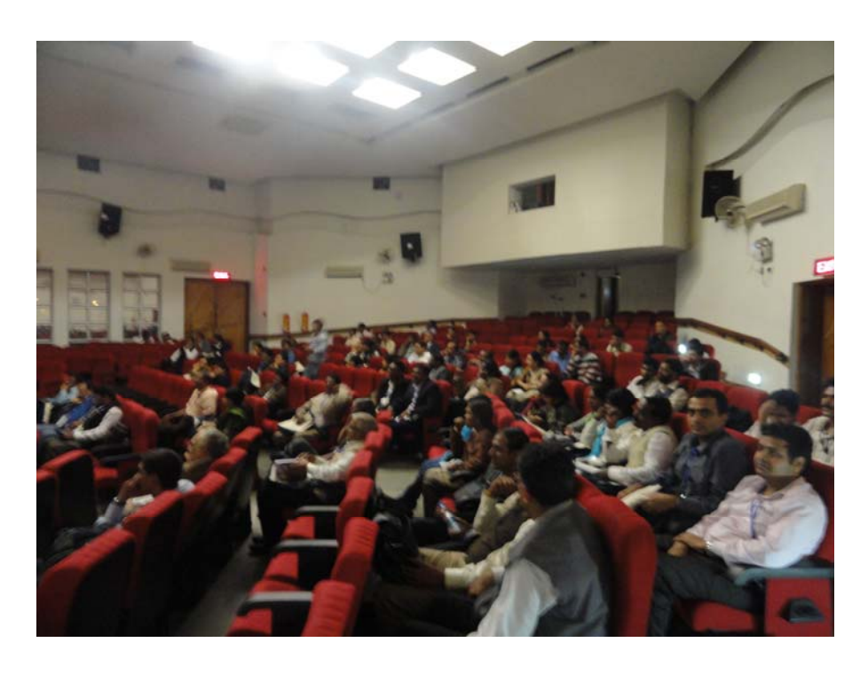
A section of the delegates during an oral session