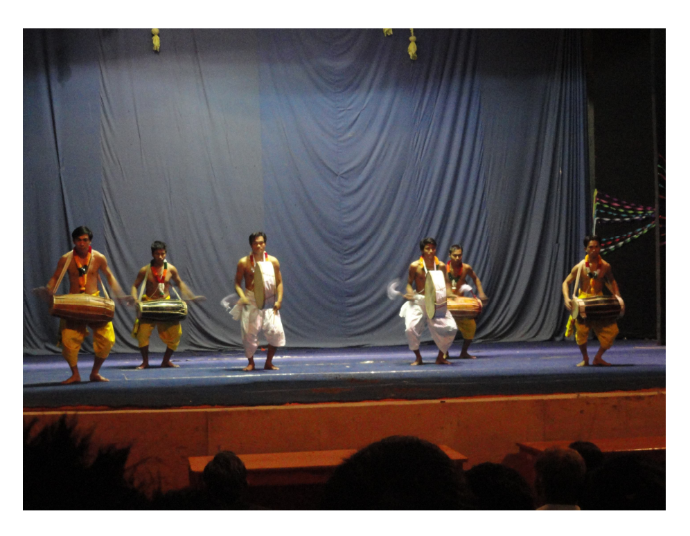
A view of the Cultural program