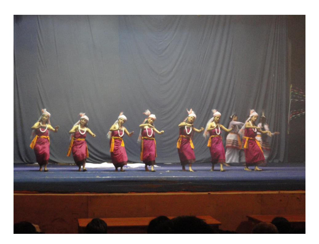
Manipuri dance during the cultural program at night