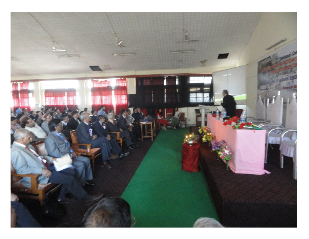
Section of the audience during an invited talk