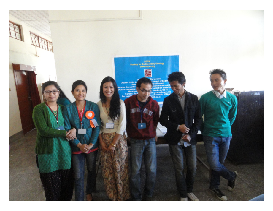
Enthusiasms of students at the SEPM booth