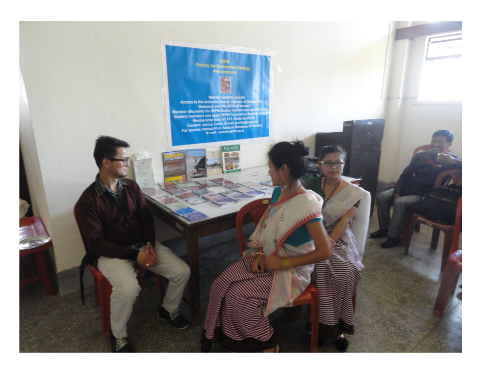
Prospective SEPM student members at the SEPM booth