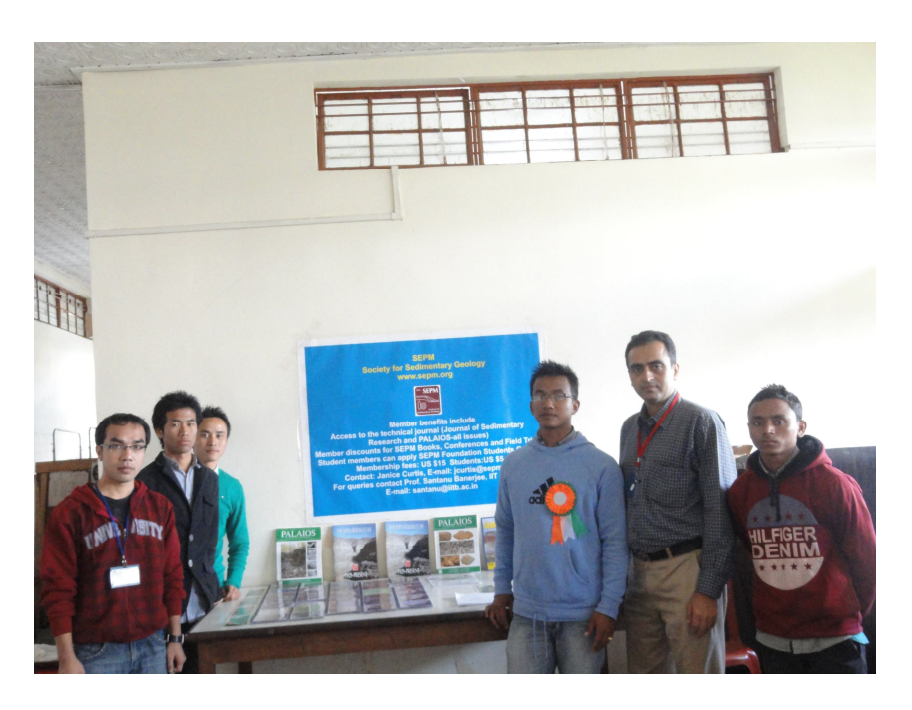
SEPM ambassador with the student participants and volunteers