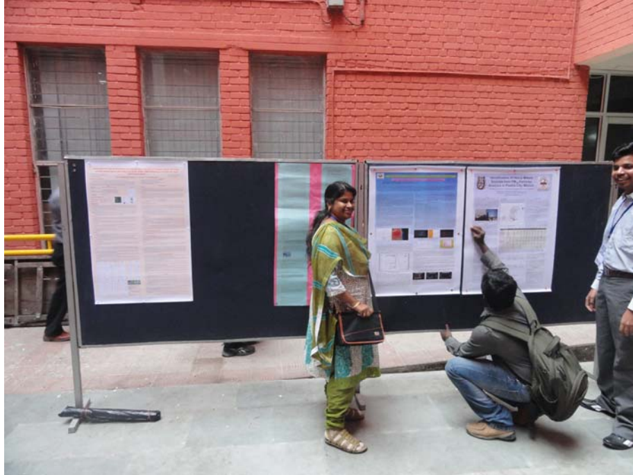
Posters session attended by the delegates