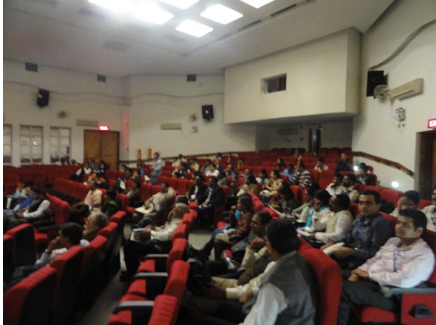
A section of the delegates during an oral session