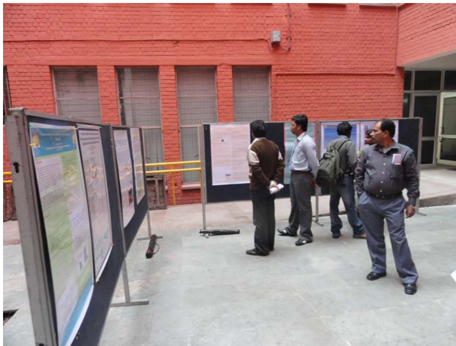
Delegates attending the poster session