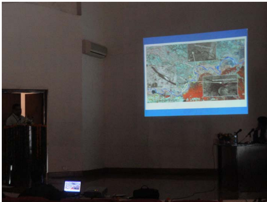
Oral presentation in one of the two hall