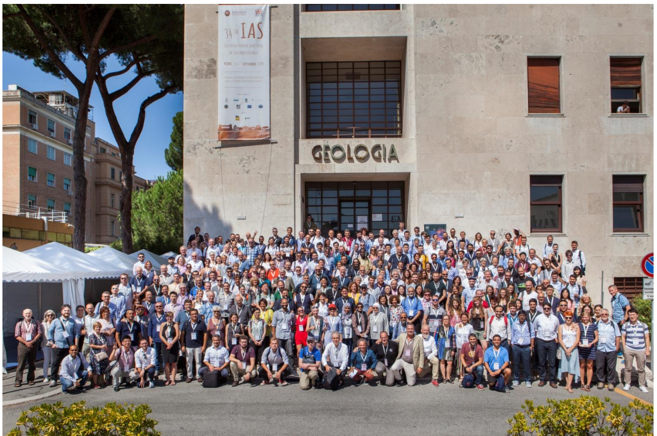
Fig. 4: IAS delegates during the 34 th IAS Meeting in Rome (September, 10-13 September, 2019) at the main entrance of the Geology Institute of Earth Science Department of La Sapienza, University of Rome (Italy)

Many thanks are due to delegates (Fig. 4). The IAS Organizing Committees decided that the next meeting will be held at Prague (Czech Republic) next June 22-25, 2020.